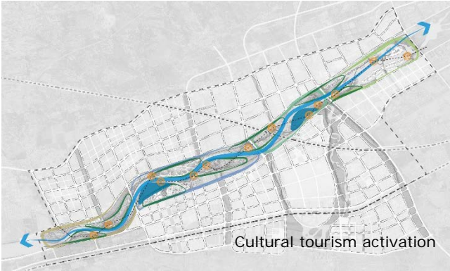
Cultural tourism activation