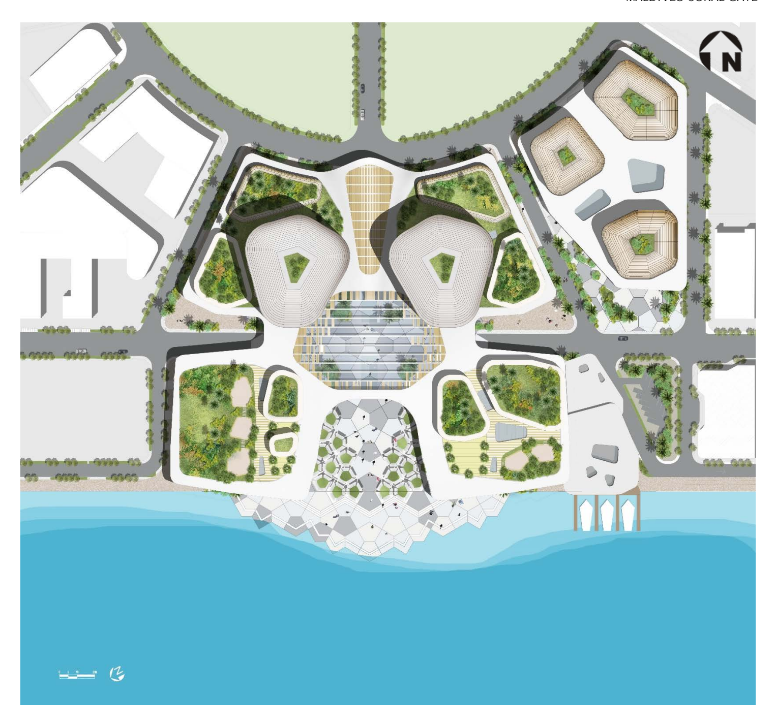
Project Master Plan 场地总图